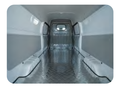
One-piece steel barrier ALL FLAT High-strength aluminum flooring designed